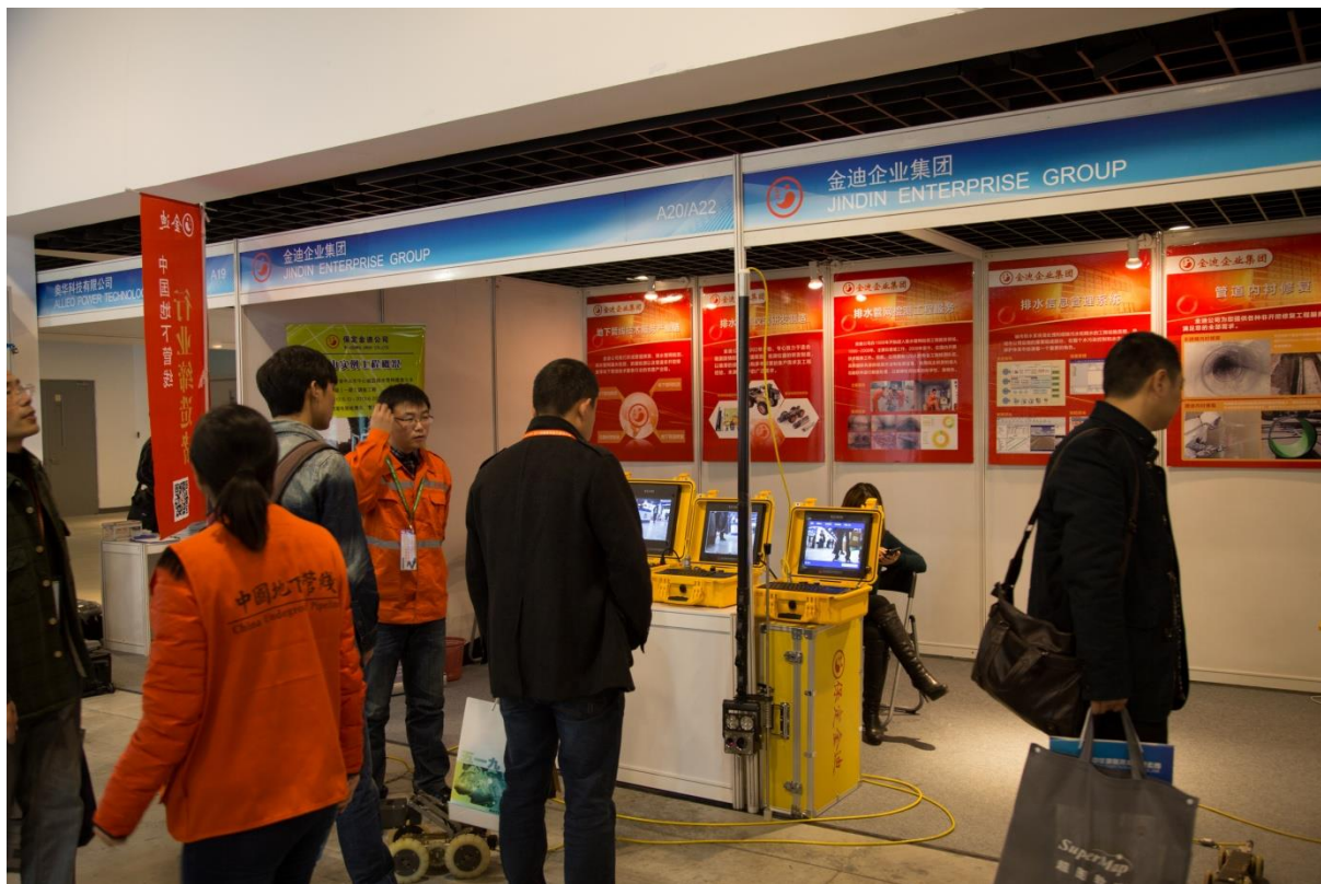
One of the exhibitors was demonstrating their advanced equipments.

Safety : Chongqingshi Rongguan Technology Co., Ltd 、 Beihang University