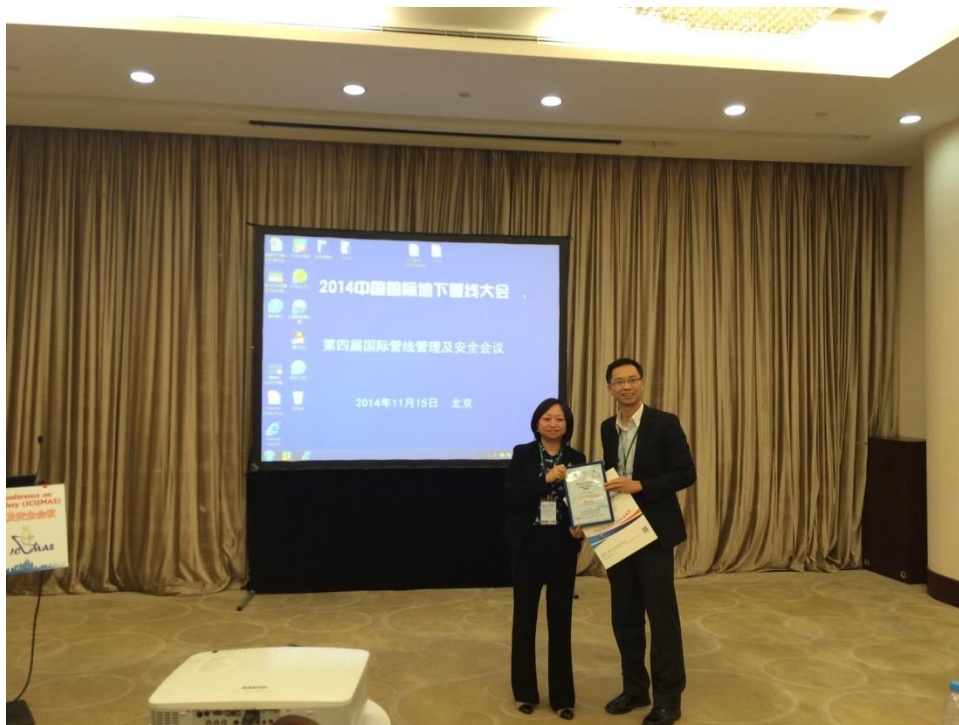
Session chair presented the Appreciation Certificates to every speaker.