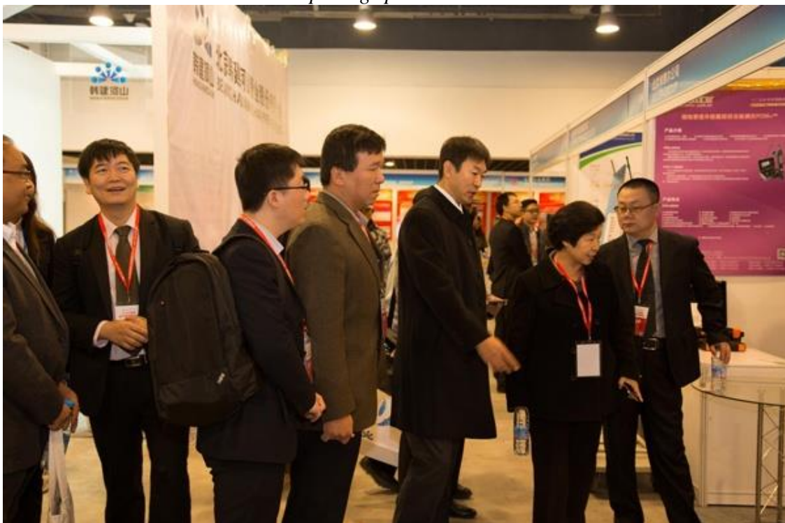
The guests were taking a tour in the exhibition after the opening.