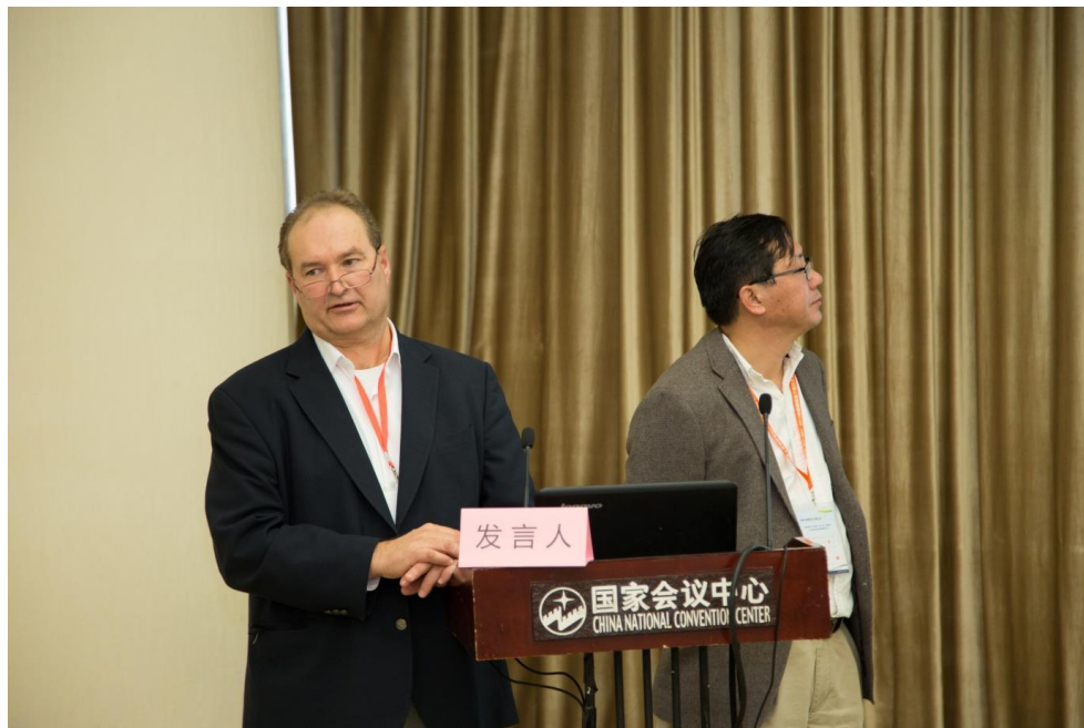
One of the speakers explained how to apply sonic in underground utility (APL 地下 (PE) 管线探测仪—声学管线定位仪)