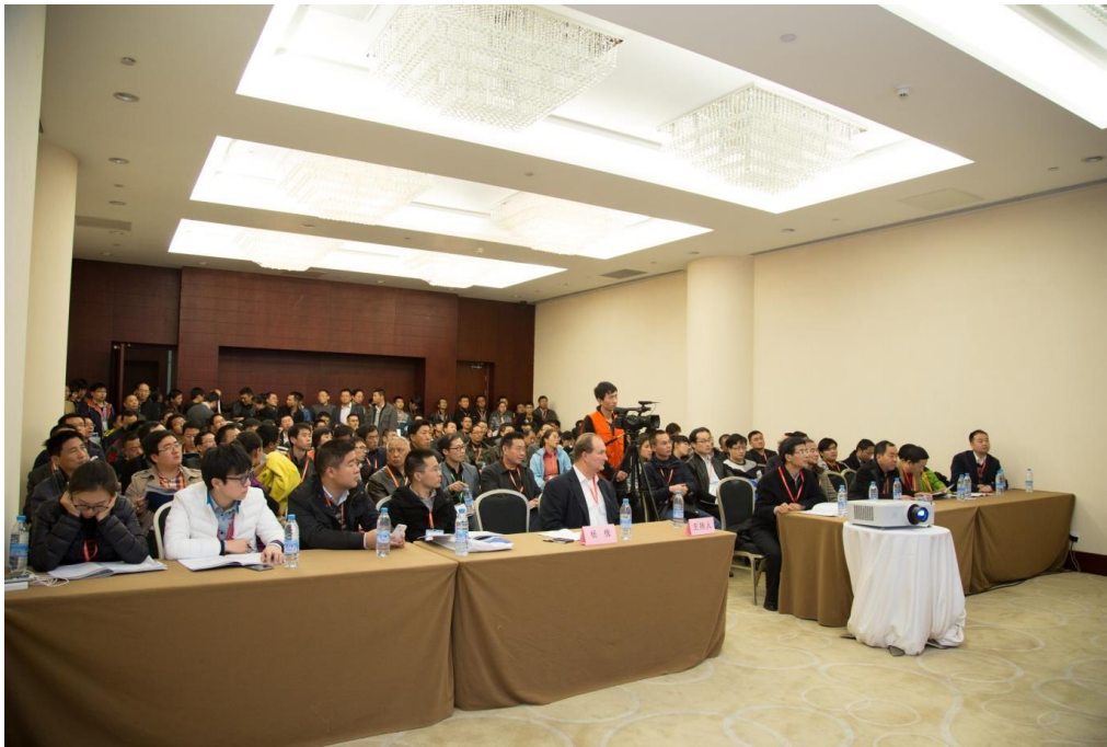
Attendees paid very much attention to the speakers.