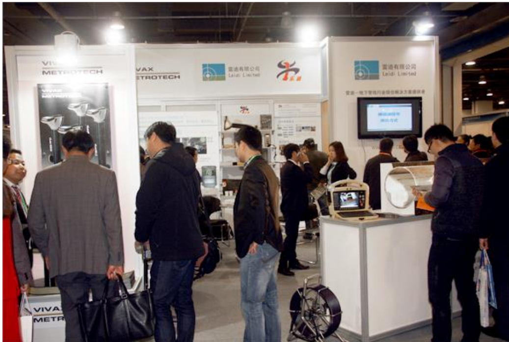
Countless visitors were exploring different exhibition counters.

The exhibition area was 8000m 2 with around 120 exhibitors who came from four corners of the globe.