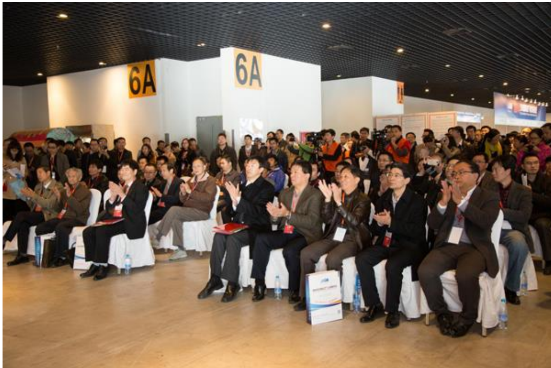
All key personnels from related industries were gathered to witness the grand opening.