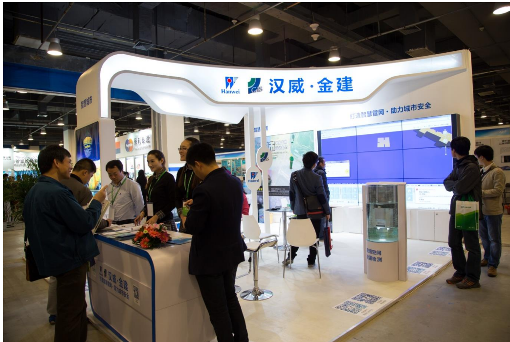
Exhibitors were interacting with different visitors