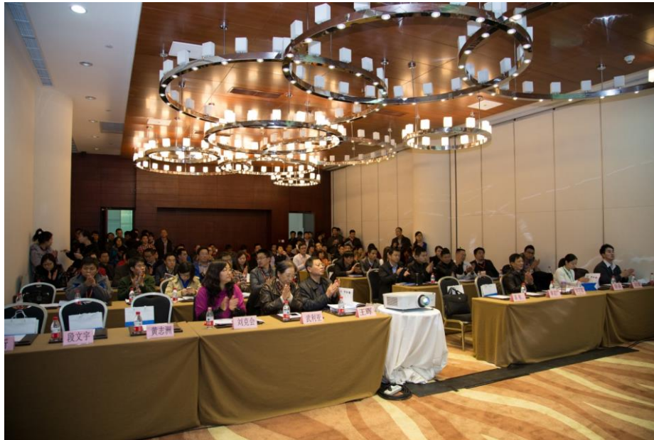
The speech won a critical applause.