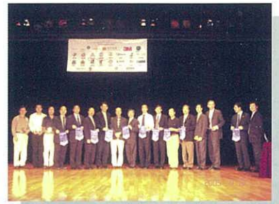
Technical Seminar on Contemporary Legal in the Utility Industry of Hong Kong

With the growing concerns within the utility industry over the current legal issues arising in recent years from the identification, protection and management of various underground utility facilities in our city, HKIUS held a technical seminar on Contemporary Legal in the Utility Industry of Hong Kong in September 2005.