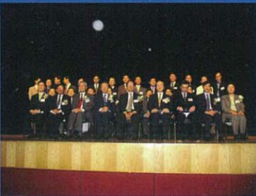
Open Forum - The public interest in reducing road opening and safer excavation by using a GIS based at the utility information center

The delegates would have a precious opportunity to learn about the latest practices and developments in utility planning, production, management and safety from the four corners of the world.