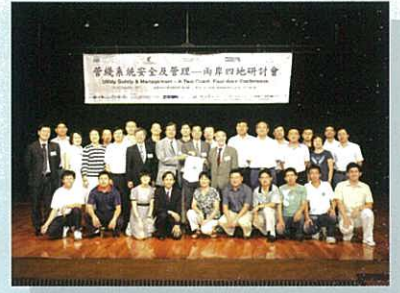
The Greater Conference

Anticipating to the plentiful potential opportunities and the responsibility to promote the rapid development of urbanization market in the Greater China (Mainland China, Hong Kong, Macau and Taiwan) in the near future, HKIUS jointly organized a Greater China Conference on Utility Safety & Management with 中國城市規劃協會地下管綫專業委員會, HKARMS, HKIE-SSC, HKIUS, IOSH (Hong Kong) at Chiang Chen Studio Theatre of The Hong Kong Polytechnic University on 14 -15 September 2007.