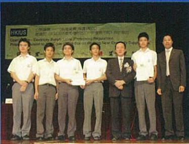
Open forum - Electricity supply lines (Protection) regulations proposed revision to the code of practice on working near electricity supply lines

In September 2004, there was another open forum organized by HKIUS at the Chiang Chen Studio Theatre of The Hong Kong Polytechnic University. It attracted around 200 participants to the forum including government officials, consultants, contractors, utility undertakers and utility surveyors.